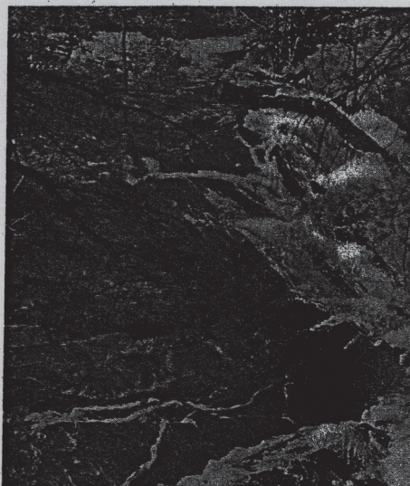
One of the falls of the Raquette in Stone Valley.

An example of what can happen when business, government and an ADK Chapter work together.