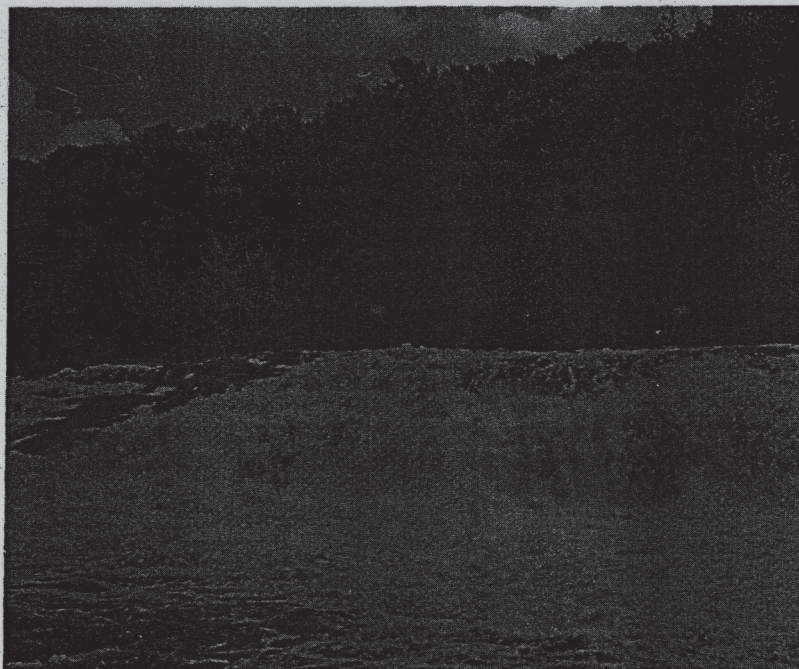
The Raquette, full of misty spring runoff, in Stone Valley.

We needed a bridge over the huge penstock barring easy access to the Colton west side trailhead. Our plans did not call for this to be completed until the summer of 1990 at the earliest. However, the power corpora-