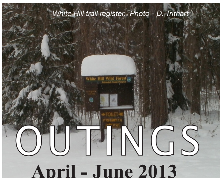
White Hill trail register.