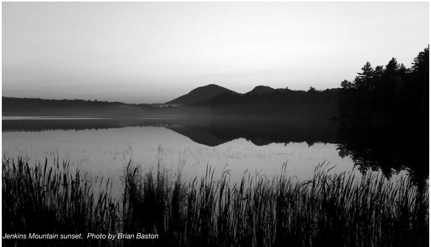
Jenkins Mountain sunset.