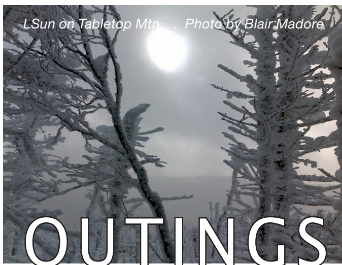
L Sun on Tabletop Mtn.