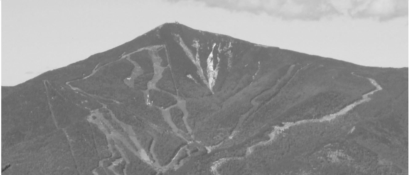
Whiteface Mtn. from Jay Range.