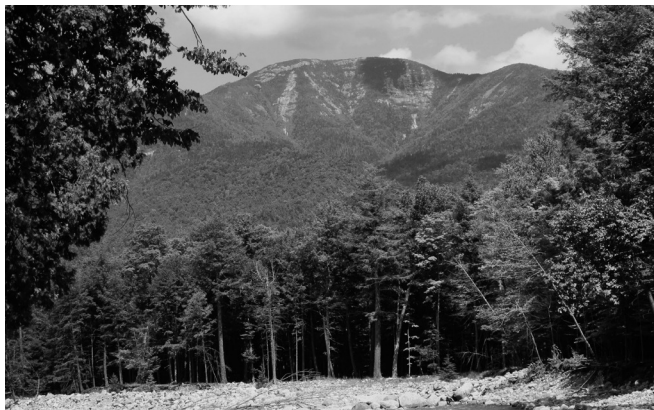
Giant Mountain from West River Trail.

Sun. Jan. 1 - New Year Day Potluck - New Year's day Outing and Potluck at the Spencer's in Canton, 545 Pink Schoolhouse Road (off the Canton Russell road about 4 miles South of Canton). Some Options: If we're lucky and have snow, there is skiing at the Best Western Golf course, or the Kip trail. Also snowshoeing or hiking or skiing (a little tougher than golf course skiing) on the Spencer's property trails. Plan to eat about 2:30. Contact Ann Spencer (315) 379-1383.