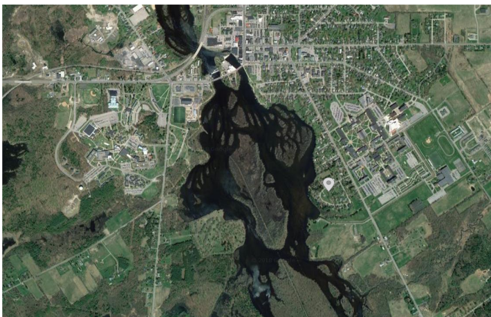
Raquette River Islands—Potsdam