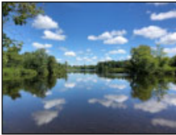
2020—A Perfect Mirror