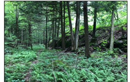
Blue loop at Glenmeal State Forest

(rescheduled to June 12 th due to weather) It was a cloudy day, with many mosquitos to keep us company. We explored several of the loops and everyone helped with wildflower identification. We found that the trails were a bit overgrown, and we all agreed that this would be better as an early Spring walk. It is certainly a fine snowshoe destination.