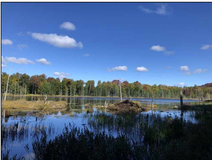
Beaver Dam at Lost Pond

Mark your calendar! Sunday, January 1, 2023 is the date of our annual New Year's Outing at Higley Flow State Park. Snowshoe or ski and enjoy refreshments with old and new members!