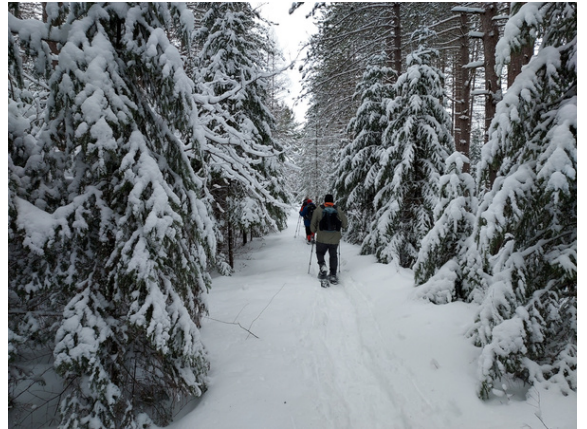
Photo: Snowshoeing down the old Grass River rail line.