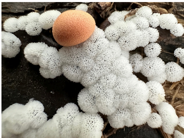
Artistic: Wolf's Milk and Coral Slime Mold